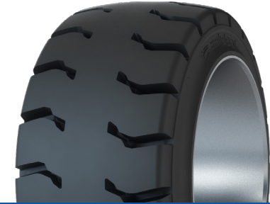
SOLIDEAL PON 552 MAGNUM SEMI