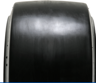
SOLIDEAL PON 555