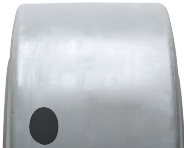
SOLIDEAL PON 775 NMAS