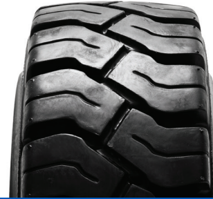
SOLIDEAL PON 550