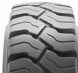
SOLIDEAL MAGNUM TR NM