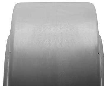
SOLIDEAL MAGNUM SM NM