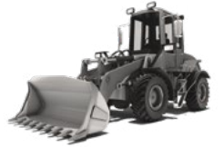
COMPACT WHEEL LOADERS