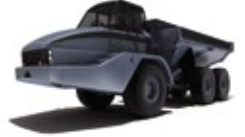
ARTICULATED DUMP TRUCKS