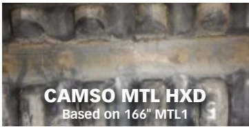
CAMSO MTL HXD Based on 166" MTL1