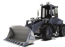
COMPACT WHEEL LOADERS