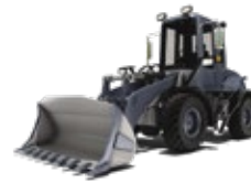
COMPACT WHEEL LOADERS