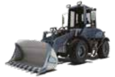
COMPACT WHEEL LOADERS