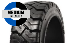
SOLIDEAL PON 550