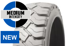
SOLIDEAL PON 550 NM