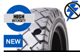
SOLIDEAL RES XTREME NMAS