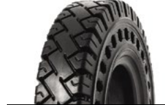
SOLIDEAL SOLIDAIR LT