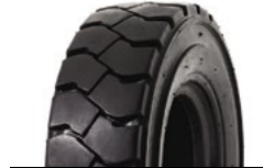
SOLIDEAL HAULER LT