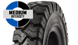
SOLIDEAL RES 550 MAGNUM SERIES