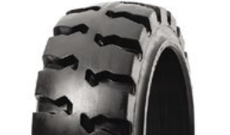
SOLIDEAL ECOMATIC TRACTION