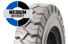
SOLIDEAL RES MAGNUM NM