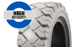
SOLIDEAL RES XTREME NM