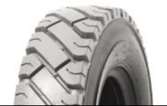
SOLIDEAL ED PLUS NM