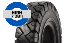
SOLIDEAL RES 660 XTREME SERIES