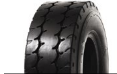
SOLIDEAL AIR 570