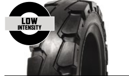
SOLIDEAL RES 330