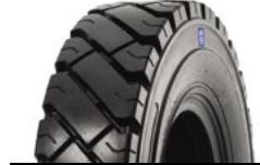
SOLIDEAL AIR 550