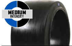
SOLIDEAL PON 555