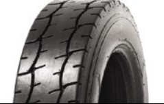
SOLIDEAL AIR 561