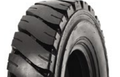
SOLIDEAL PORTMASTER HD