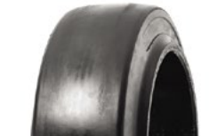
SOLIDEAL ECOMATIC SMOOTH