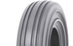
SOLIDEAL RIB NM