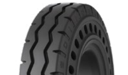
SOLIDEAL SOLIDAIR ZZRIB