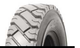
SOLIDEAL ED PLUS NM