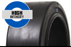
SOLIDEAL PON 775