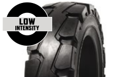
SOLIDEAL RES 330