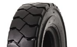
SOLIDEAL HAULER LT