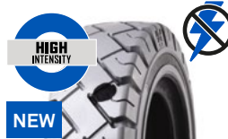
SOLIDEAL RES XTREME NMAS