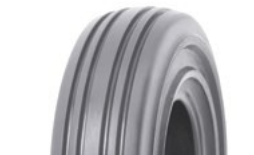
SOLIDEAL RIB NM