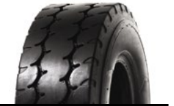
SOLIDEAL AIR 570