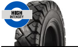
SOLIDEAL RES 660 XTREME SERIES