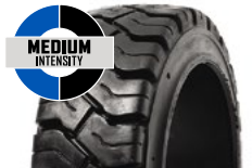
SOLIDEAL PON 550