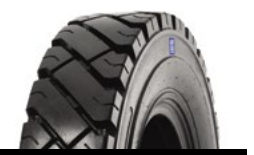
SOLIDEAL AIR 550