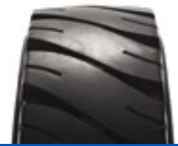
SOLIDEAL PORTMASTER HD