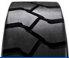
SOLIDEAL HAULER LT