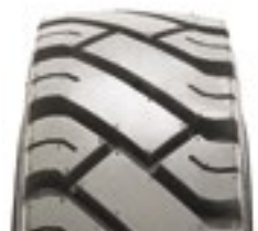
SOLIDEAL ED PLUS NM