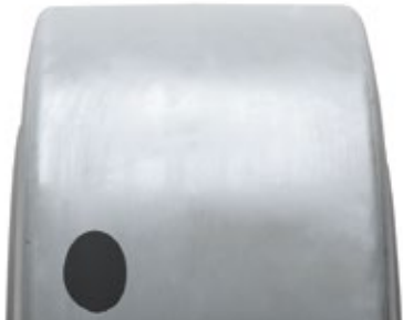
SOLIDEAL PON 775 NMAS