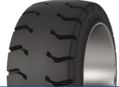
SOLIDEAL PON 552 MAGNUM SEMI