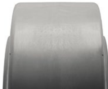
SOLIDEAL PON 555 NM