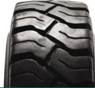
SOLIDEAL PON 550