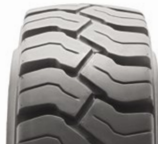
SOLIDEAL PON 550 NM