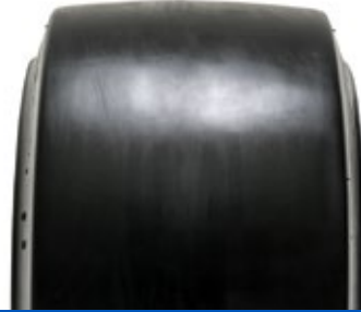
SOLIDEAL PON 555