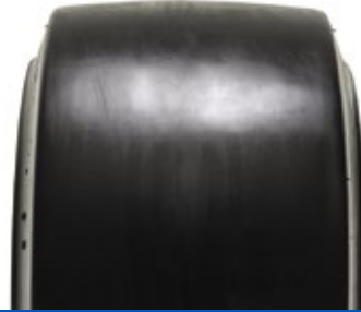
SOLIDEAL PON 555