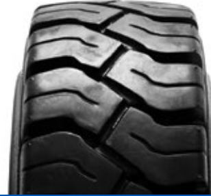
SOLIDEAL PON 550