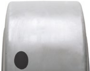
SOLIDEAL PON 775 NMAS