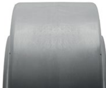
SOLIDEAL PON 555 NM