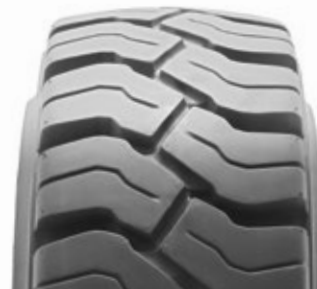
SOLIDEAL PON 550 NM