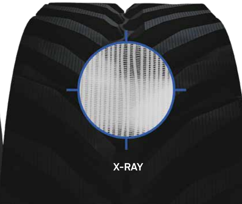
COMPETITOR MOLDING PROCESS