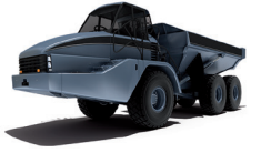
ARTICULATED DUMP TRUCKS